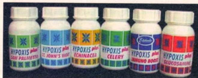
Edelweiss Range of Hypoxis Tablets

The anti-cancer, anti-HIV and anti-inflammatory activity of Hypoxis is ascribed to hypoxoside, a component that is made into rooperol by the body. This anti-oxidant has antimutagenic properties that are activated as soon as rapidly dividing cancer cells are detected! Could the genetically damaged material found in tumours and cells that damage the immune system be deactivated with rooperol from Hypoxis? During 1970 a drug based on B-Sitosterol-D-Glucoside (a sterolin) was isolated from the Hypoxis tubers. In West Germany it was mar-