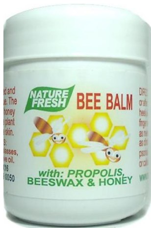
NF 019 BEE BALM 80ml jar Pack height 6 cm

Beeswax, Honey and Propolis and natural enzymes to helps to banish stubborn cases of psoriasis, discoid eczema, old dead skin flakes on fingertips, elbows and heels, ringworm and other skin disorders. Apply it after a bath to flaky, dry, cracked fingertips and heels, chapped lips, scars and on cuts or surgical wounds while they heal. There are even confirmed reports of how it helps to reduce scar and keloid formation. Psoriasis patients are also reporting a big improvement.